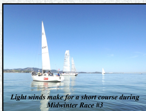
Light winds make for a short course during Midwinter Race #3