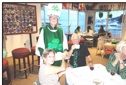
St. Patrick's Day Fun at TYC