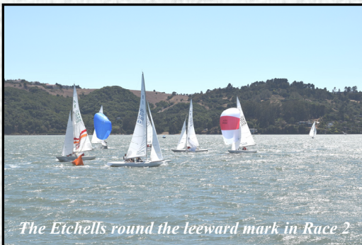
The Etchells round the leeward mark in Race 2