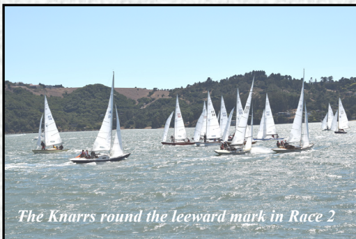
The Knarrs round the leeward mark in Race 2