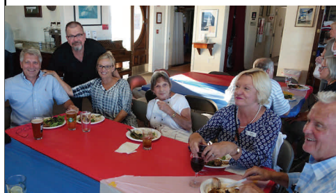
TYC members enjoy the Chicken Adobo