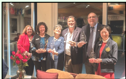
TYC's 2016 Board of Directors