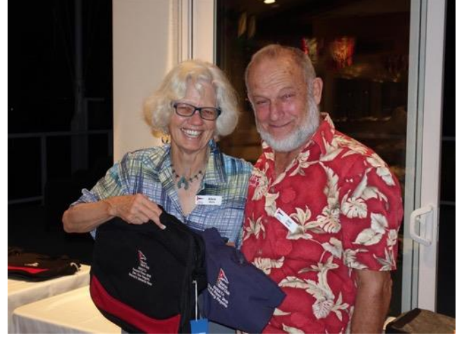
Annual Race Awards