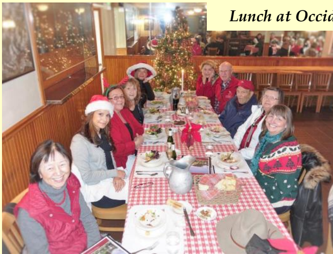
Lunch at Occidental Union Hotel