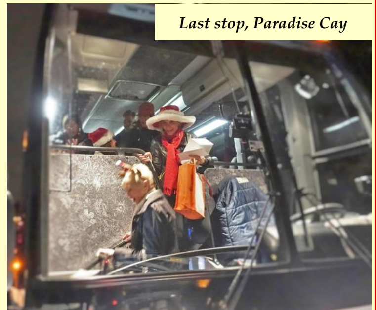
Last stop, Paradise Cay

TYC's Annual Christmas Bus: caroling, lunching, tippling, shopping and smiling. 'Twas a good time!