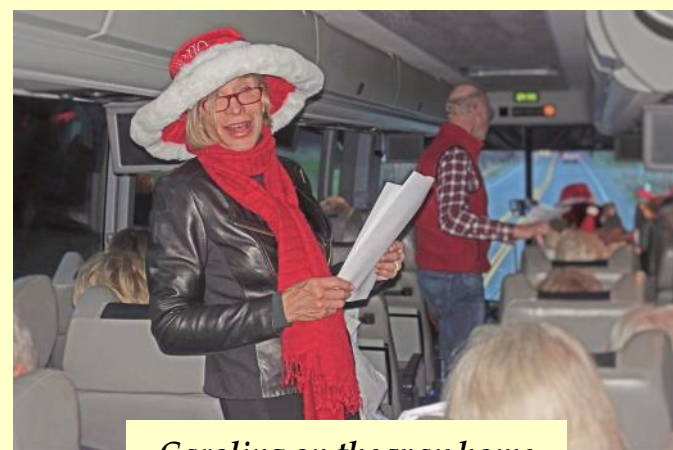
Caroling on the way home and last chance for treats