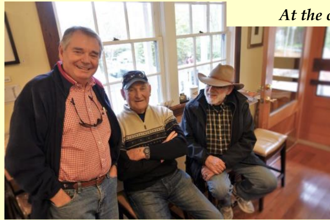
At the cheese shop