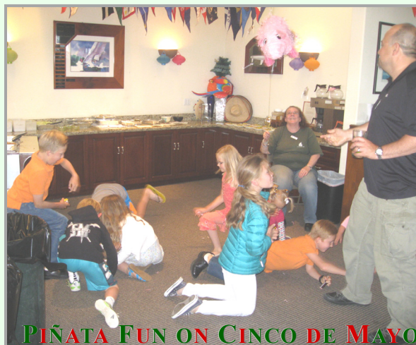
PIÑATA FUN ON CINCO DE MAYO