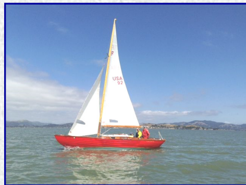
Galante — Winner Non-spinnaker Division