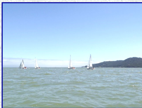
Ultimate 20's at the start line