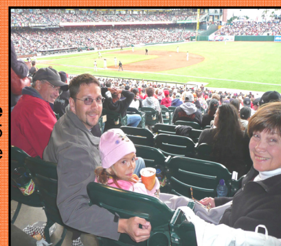
Three Generations of TYCers at the Ball Game