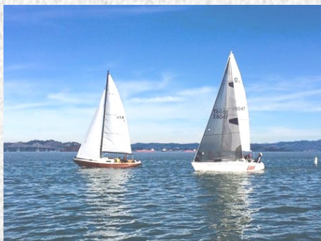
Cinnamon Girl and Lion at the start of race two

On the beat to the windward ISO mark, Siento el Viento and Cinnamon Girl headed to the shore side of the course, seeking relief from the ebb current, while Lion stayed out nearer the shipping channel, favoring a stronger breeze over adverse current. And Lion 's strategy paid off, rounding mark three with a sizable lead over the nearest competitor, Siento , and holding that lead through to the finish line. Lion would win race one on corrected time, besting eventual second place finisher Siento . Cinnamon Girl persisted on the course and earned a third place finish for their effort.