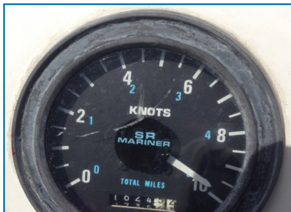
2 - Surfing a C&C 29 on the small crests!

The wind kept increasing and we were passing more boats, but now it was starting to get a bit wild as we approached Point Pinole. "Okay, it's time. Unfurl the jib and douse the spinnaker." It was a good call; we had the spinnaker safely away as some strong gusts came through and broaching went on all around us. Around Point Pinole, sailing wing-on-wing with a full main and #3 jib, and still surfing at 10 knots in the strong ebb with the wind in the high teens to low 20's, we debated whether to put the spinnaker back up. We were almost ready to do so but then called it off because of yet another strong gust.