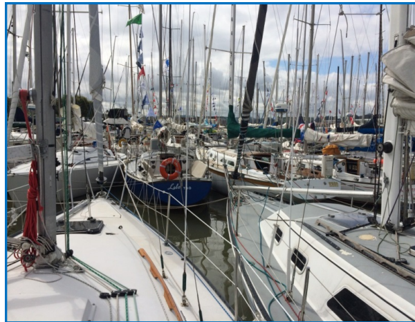
4 - The raft up at Vallejo YC

So next year let's have more TYC racers come and have fun. The sail up is usually much tamer than this year, and having fun both on and off the water is definitely part of the Great Vallejo Race DNA!