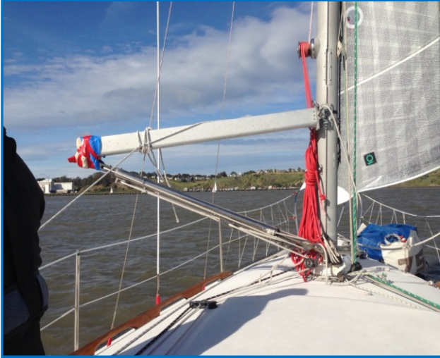
3 - Boom secured – ready to continue to Vallejo!

(The Great Vallejo Race 2014 continued )