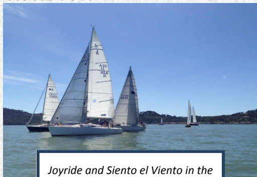
Joyride and Siento el Viento in the second race starting sequence

Lots of Racing Coming up in May: May 9 is the Sinko De Mayo Regatta, or shall we call it a Fiasco? We thought we would change it up and add some fun to this race. Sign up on Jibeset.net and SI's will be posted shortly. Hint: We will run this race similar to the Three Bridge Fiasco, only it will be raced off of the Cay as usual. Margarita's after the race at the club!