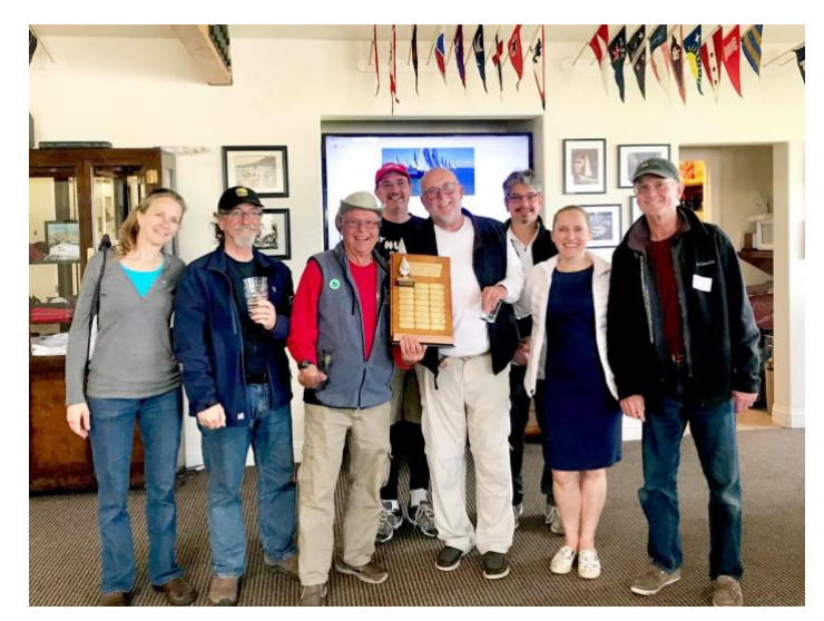
The crews of Siento el Viento and Lion earned the trophy, with two bullets each

The next two races formed the series for the actual Don Wan trophy. Unfortunately, Joyride encountered a problem with their forestay and had to retire. Siento el Viento had an exciting race