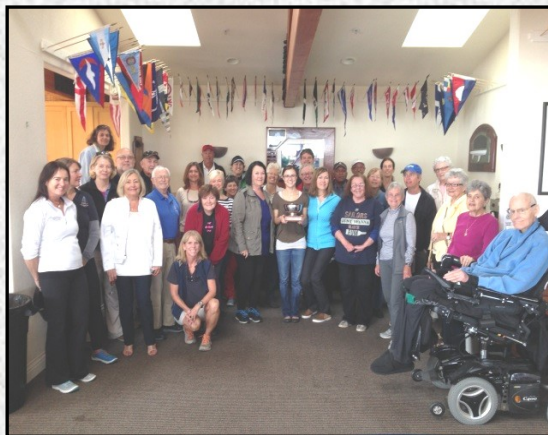
A fun time was had by all at the 25th Anniversary of the Joan Storer Regatta