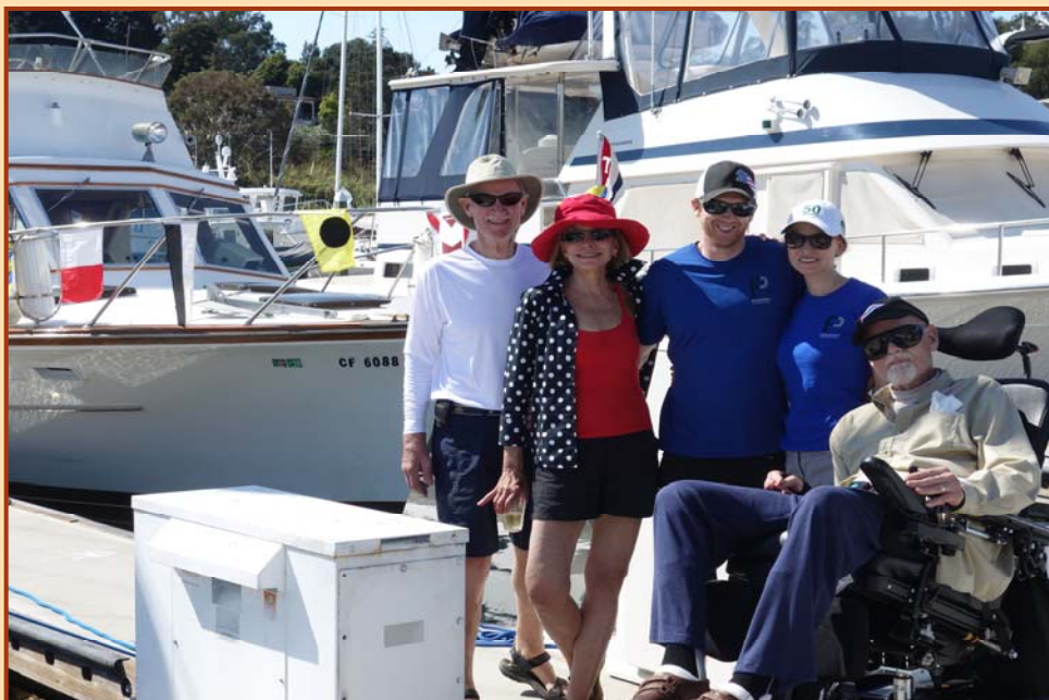
TYC members in front of Solveig's Song, one of the cruising yachts open for touring during the Open Boats event during last month's Commodore's Cruise & Picnic.

October 3-5 - Five Club Cruise to Tinsley Island.