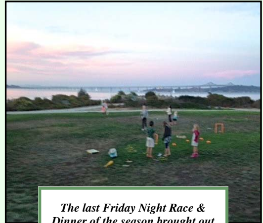
The last Friday Night Race & Dinner of the season brought out lots of kids.