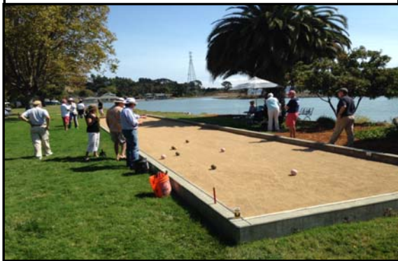
The Ever-Popular Bocce Ball Court