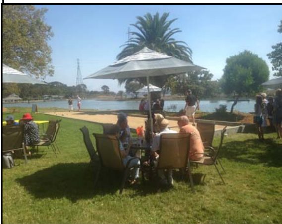
Lunch on the Green