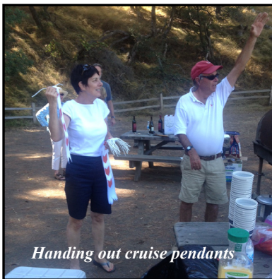
Handing out cruise pendants