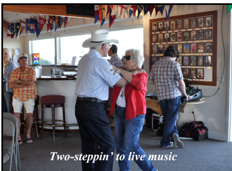
Two-steppin' to live music