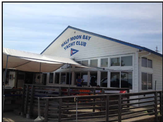
Left side: Lovely Half Moon Bay Yacht Club on a hot August day.