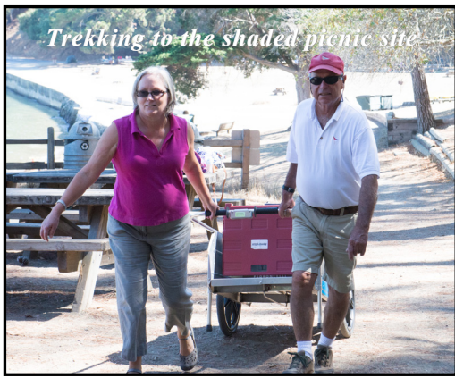
Trekking to the shaded picnic site