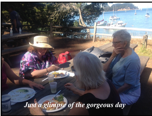
Just a glimpse of the gorgeous day