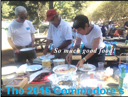
So much good food!