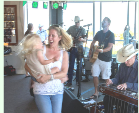
Live music and good food at this year's Rockin' Country Ribfest