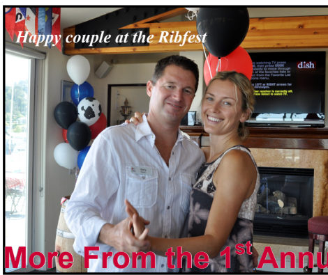
Happy couple at the Ribfest