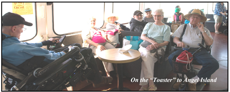
On the "Toaster" to Angel Island