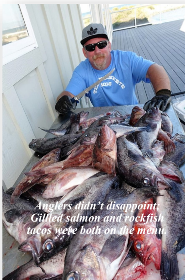
Anglers didn't disappoint: Gilled salmon and rockfish tacos were both on the menu.