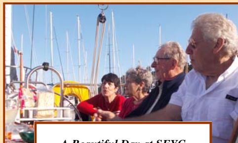
A Beautiful Day at SFYC

October 3-5 - Five Club Cruise to Tinsley Island. (See flyer on page 6.)