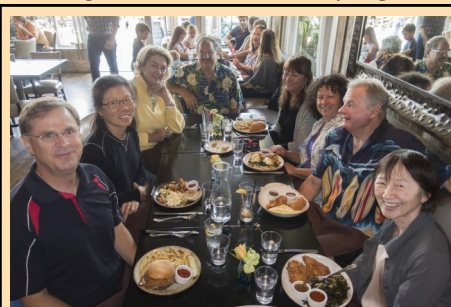
Bunch at Terrapin Crossroads