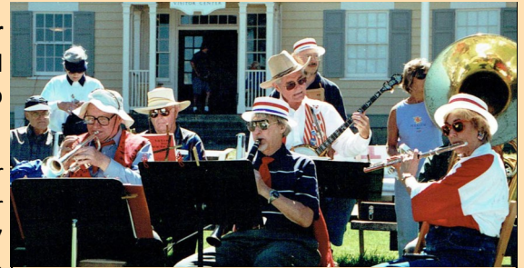
Delta Dixielanders will play at Commodore's Picnic

And so many ways to get there! Skippers - Cruise over for the day or the weekend, and volunteer to take non-boating members over from the Cay or on a Canal cruise. Sign up at tyc.org by September 17 to be assured of dock space. Sailors - Race over and compete for the Commodore's Cruise Trophy. And you can always drive.